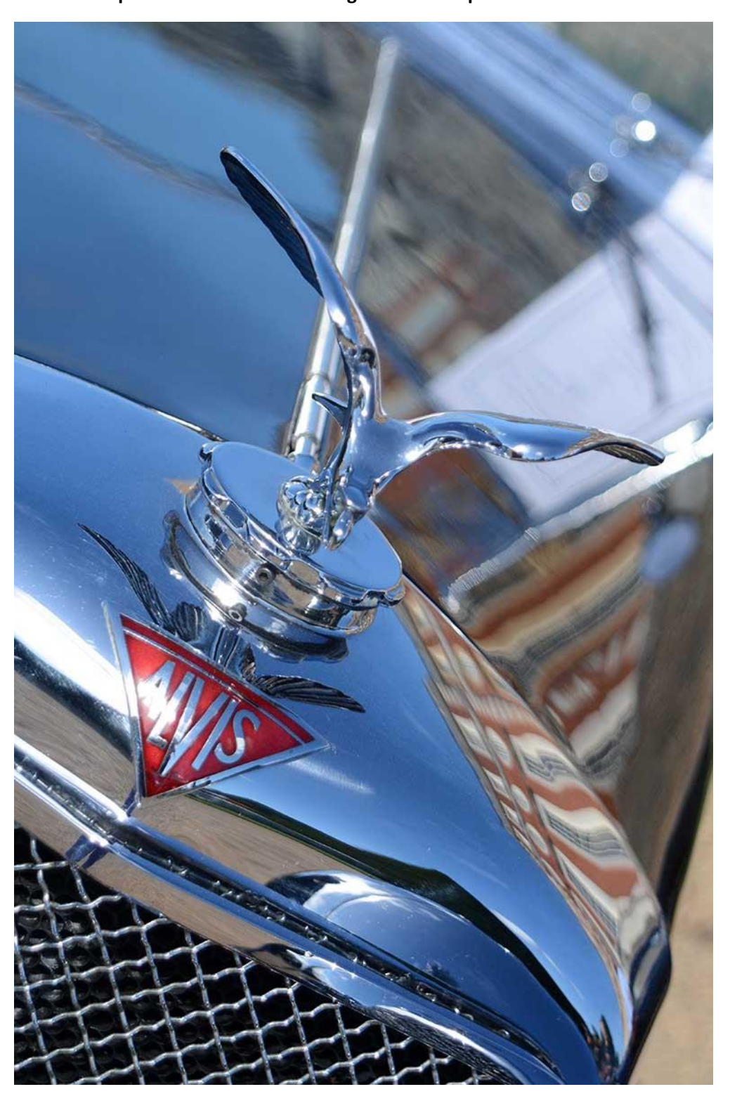
Alvis reflections of Hampton Court concours

It hasn't taken long for the Concours of Elegance at Hampton Court to become an important fixture on the classic car calendar, but for 2020 The London's Honourable Artillery Company (more of a 80-car garden party) and The Concours of Elegance at Hampton Court, both organised by Thorough Events, have proved some of the only high class events this season to have gone ahead under Covid-19 restrictions.