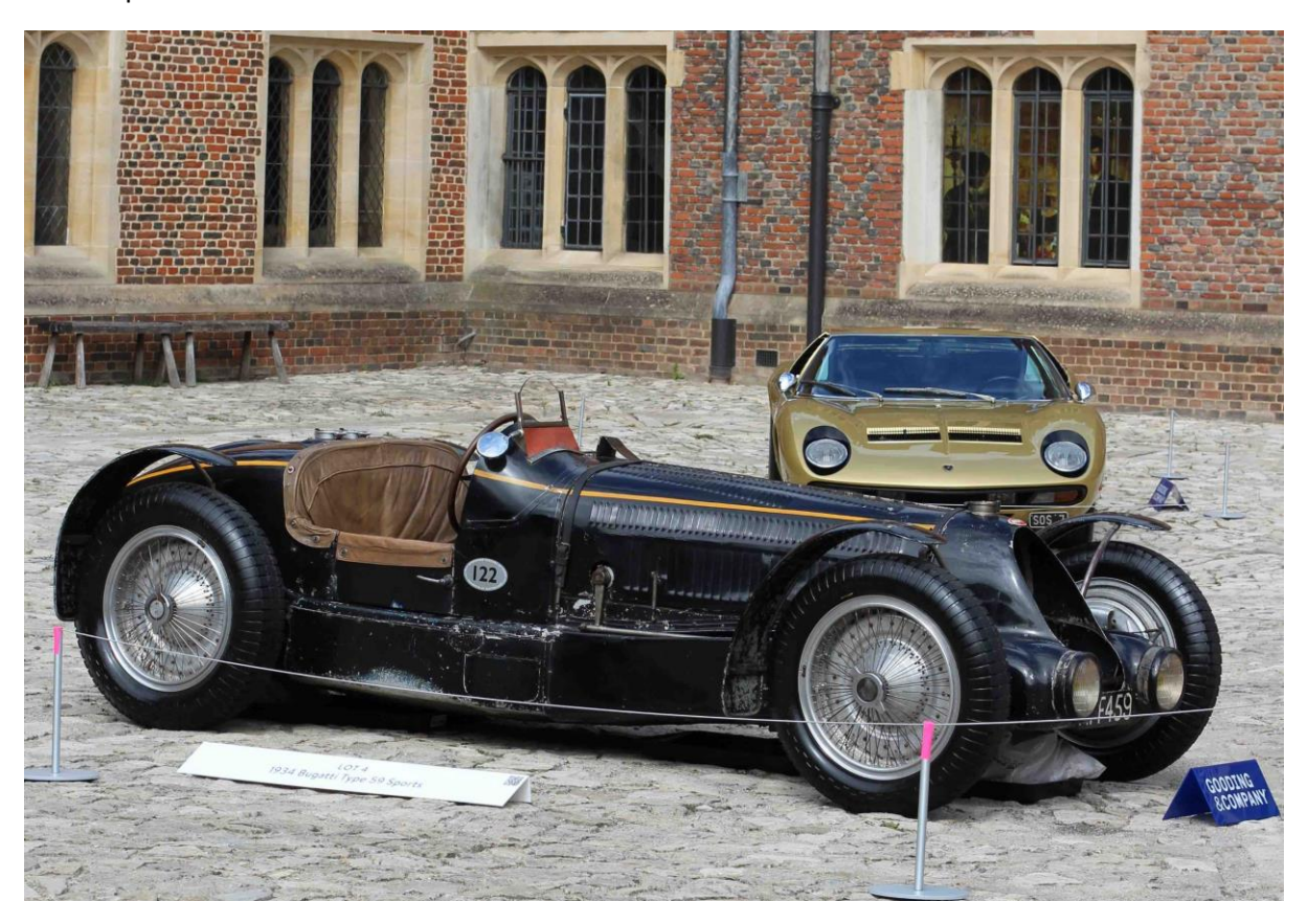
1934 Bugatti Type 59 Sports in well patinated condition.

Hidden nearest the Flower Pot gate on Saturday were three Bugattis, two being Grand Prix Type 37 but my favourite was an English -registered Type 57s with Stelvio cabriolet coachwork by Galibier. That could be compared with another Type 57 Atalante fixed-head coupe in the main Concours, resplendent in purple/black with coachwork by Gangloff, which is on the market for around £1.5 mio, but even these pale into insignificance compared to the 57S Atlantic Coupe and a sports type 59 which in the Saturday's Gooding sale fetched £8.5-9.5 mio apiece, the newest high record for a 57S. It certainly did not seem that the pandemic had affected prices negatively in this sale, with over £33.86 mio taken, selling all but one of 15 cars; quite a result for their new entry into the European auction platform.