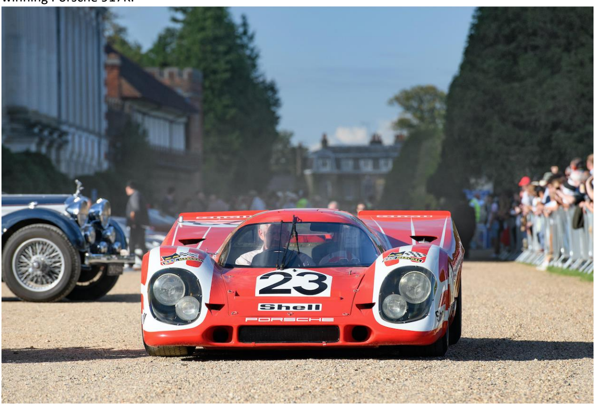
Porsche 917K given the Guard of Honour by Edmund Waterhouse's Speed 25 SB

As usual, the event included displays of various classes covering the top 50 or so cars with self-judging by the participants, but entries were clearly down, internationally, and this year, with a large display of F1 cars and other Grand prix racers, the Best in Show proved to be the 1970 Le Mans - winning Porsche 917K.