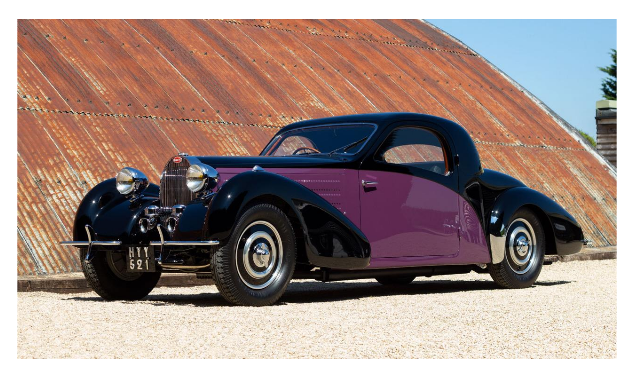
1938 Bugatti Type 57 Atalante by Gangloff, winning the Bridge of Weir Leather Design Award