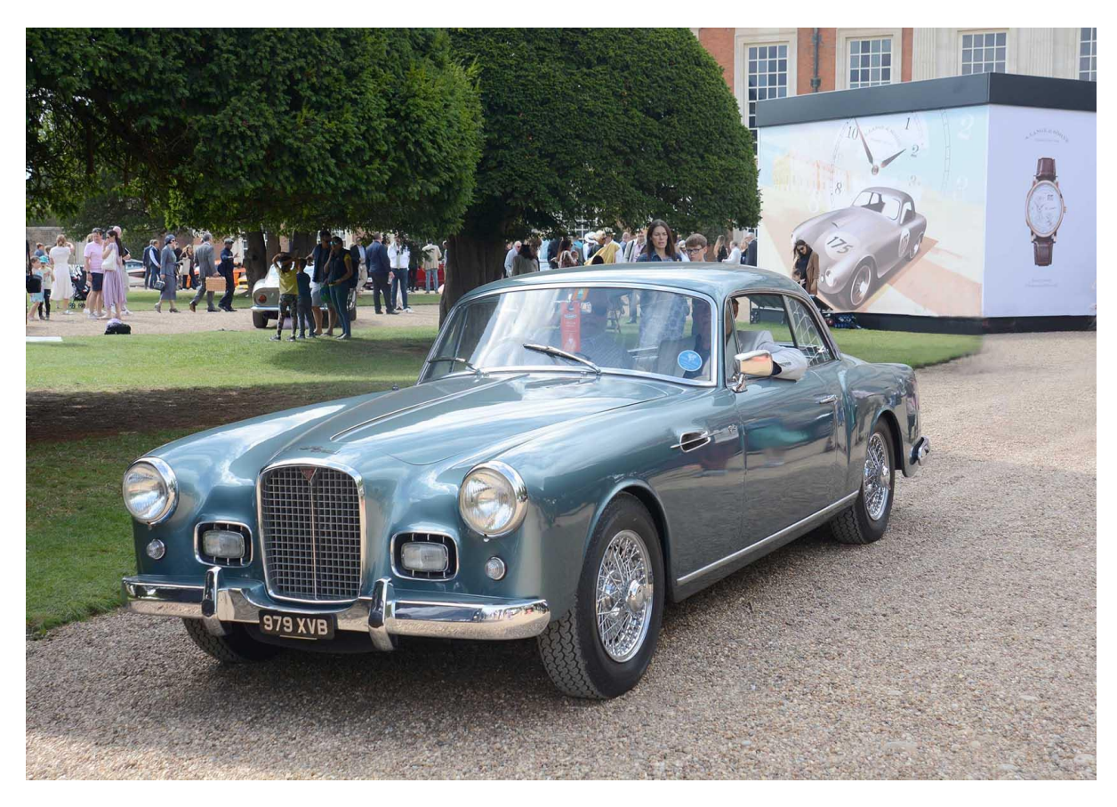
Awaiting the podium drive-past

Our Concours results from self-judging of other owner's cars were as follows: